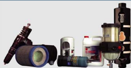
500 hours genset spare parts