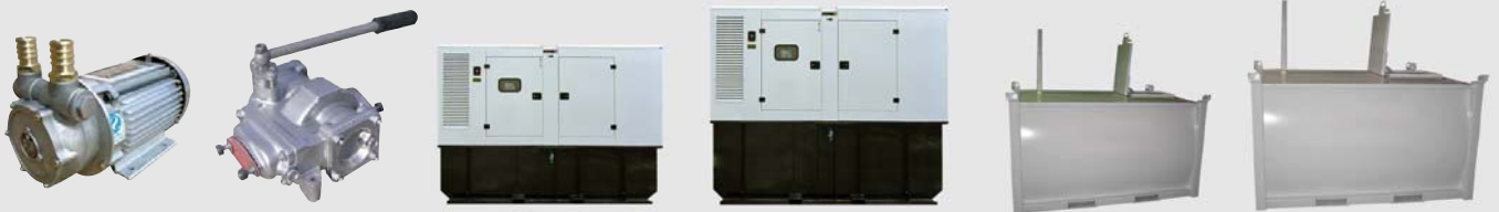
Auto filling fuel pump