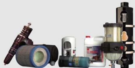
500 hours genset spare parts