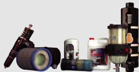
500 hours genset spare parts