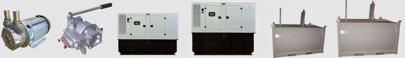
Auto filling fuel pump